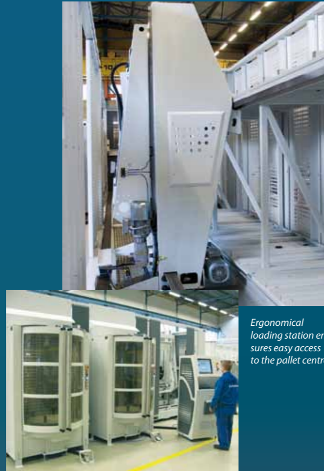
Ergonomical loading station ensures easy access to the pallet centre